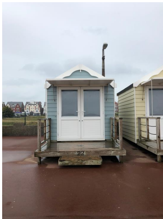
Normal Huts (Nos 11 – 45)

All Beach Huts except the Show Hut (see below), have a 25cm step up onto the front decking.